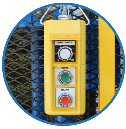
TENSION CONTROL PENDANT