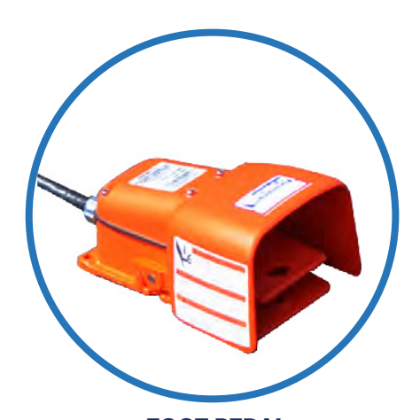
FOOT PEDAL CONTROL FOR POWERED FORWARD/ REVERSE JOG